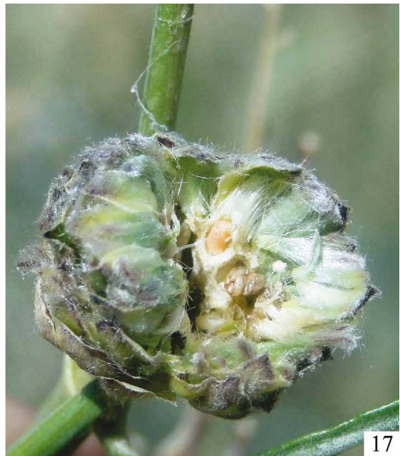
Figs. 16–17. Cephalaria microcephala Boiss. 16 – habitus of flower head in nature, 17 – flower head (= capitulum) in partial section showing one flower bud gall inside with orange coloured larva of Cephalaromyia capituli Skuhravá, sp. nov.